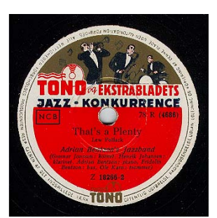
The beginning of an artist's recording career.

In 1950 the first in a series of yearly jazz amateur contest concerts were arranged in order to find the two best jazz groups, one from Copenhagen and one from the provinces. Several bands in each category competed with each other and a panel of scholars finally decided on the winners. In 1953 Tono and the daily paper "Ekstrabladet" arranged the concert which took place on Saturday. November 11<sup>th</sup> in Odd Fellow-Palaet (Palais) in Copenhagen. Besides of the honour each winning band also got the opportunity to record one side for Tono like the above mentioned.