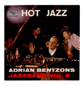
Storyville EP, SEP 357