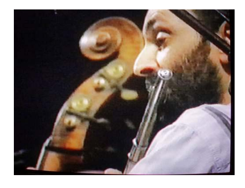
Urru in a close-up mix.