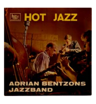
Storyville EP, SEP 332